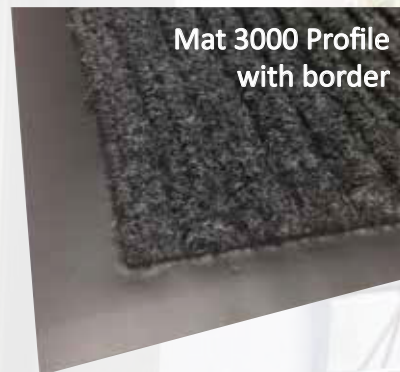
Mat 3000 Profile with border